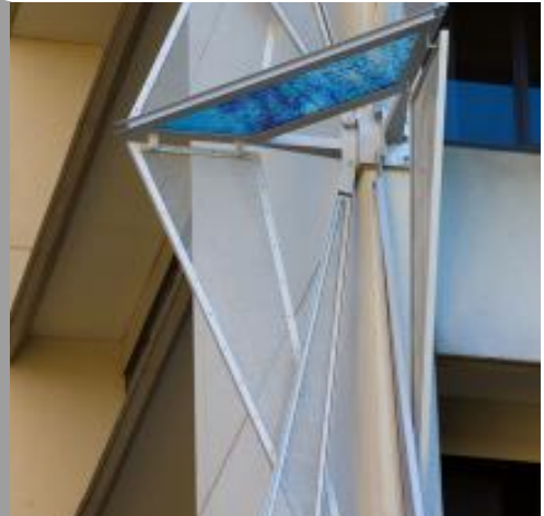
* Typical Architectural Installation