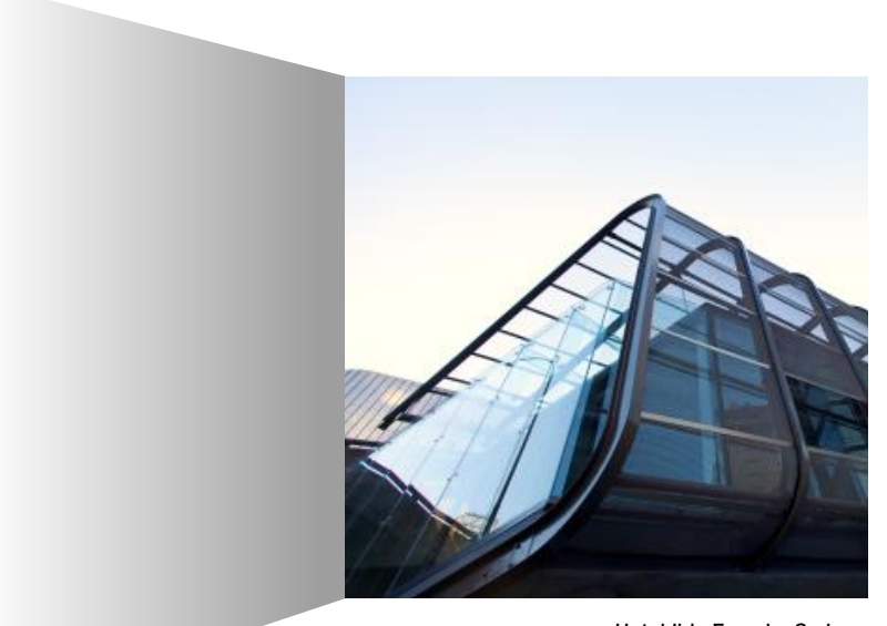
Hotel Ibis Façade, Sydney

Type Rigid Wire Dia 3.15mm Aperture 12.7mm Form Sheet/Roll