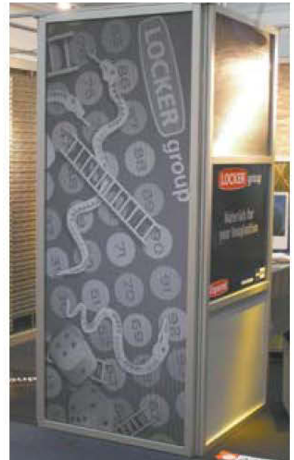
PIC PERF® IMAGE