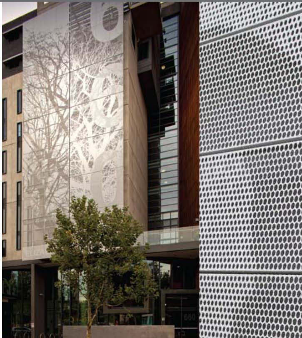
IMAGE IS CREATED USING DIFFERENT SIZED HOLES