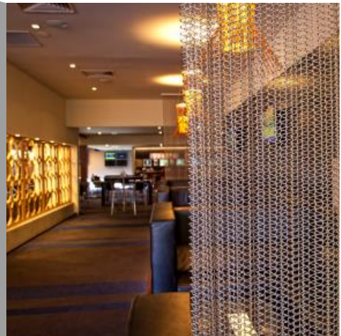
* Typical Architectural Installation