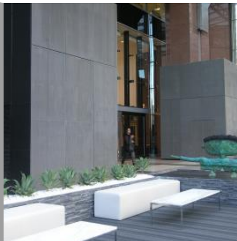
* Typical Architectural Installation